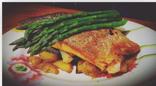
Pan-seared Salmon with Fried Potatoes and Asparagus