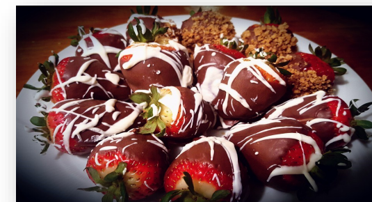
Hand-dipped Chocolate Strawberries